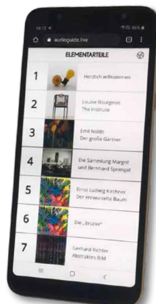
visitor's smartphone display